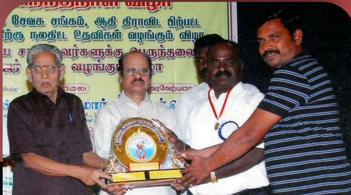
GOLDEN STAR MILLENIUM AWARD BY NATIONAL INTEGRITY CULTURAL AWARD 2008