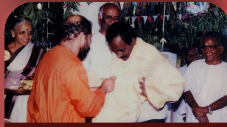
CHINMAYAA VIDYALA DECENNIUM CELEBRATION AWARD 1999