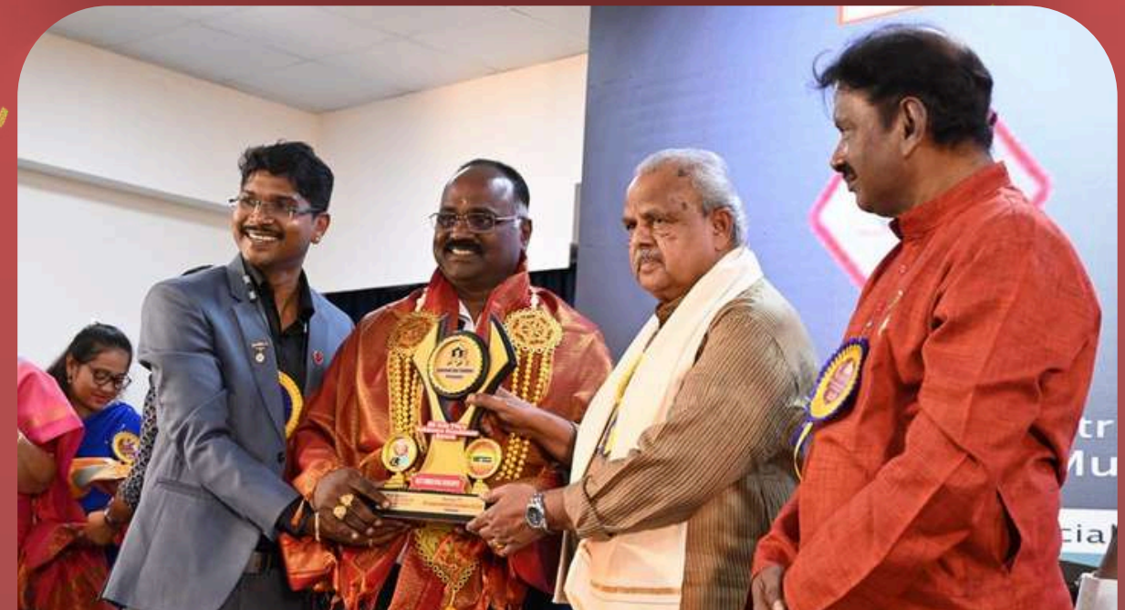
ACHIEVERS AND EDUCATIONAL EXCELLENCE AWARD 2023