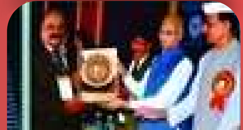
AWARD INDIAN LEADERSHIP AWARD FOR INDUSTRIAL DEVELOPMENT BY ALL INDIA ACHIEVERS FOUNDATION 2013