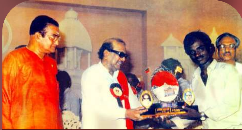
KALAINGAR THIRUMANA MANDAPAM ENGINEER AWARD 1988